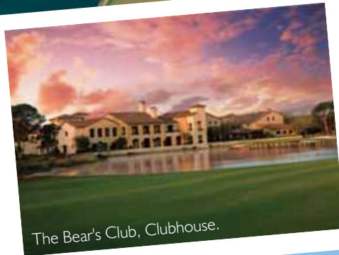
The Bear's Club, Clubhouse.